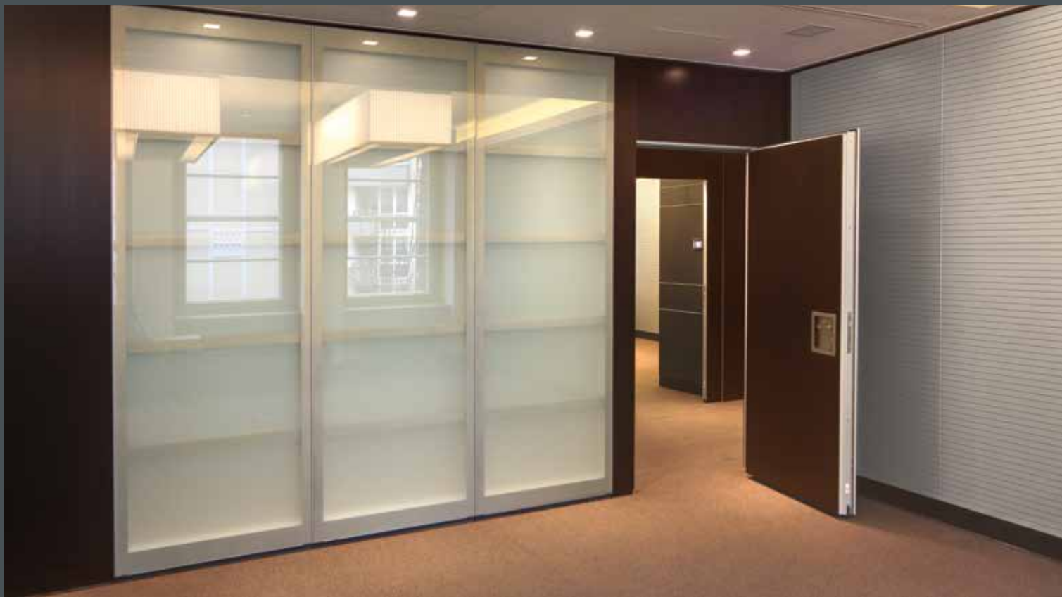
Transparency and Lightness