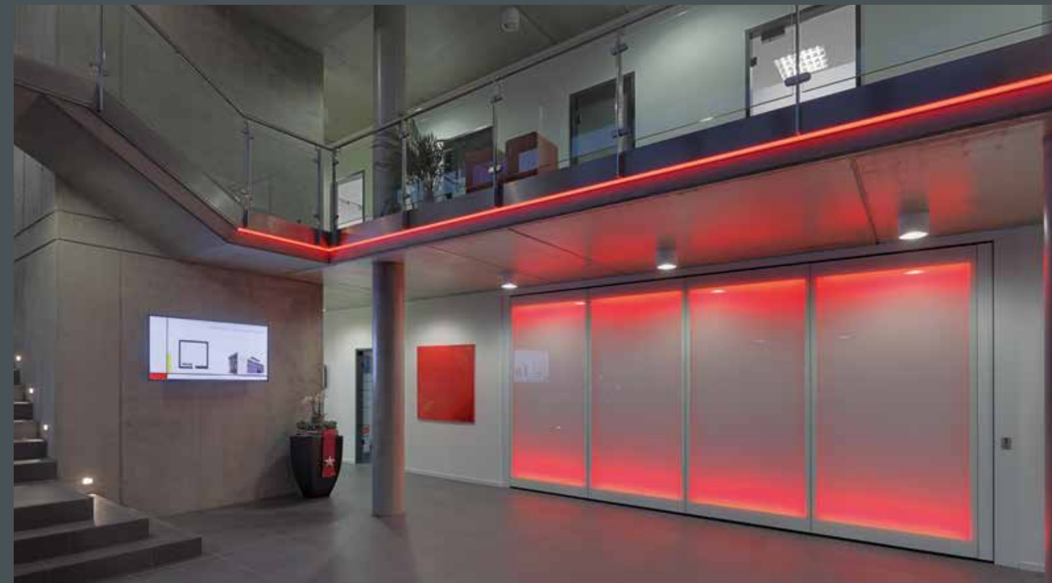
Individual – like at home